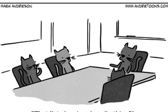
"That 'let sleeping dogs lie thing?" We need to co-opt that."

Up Christmas drive in late November and early December in which we invite the community, and particularly the churches, to hand out shopping bags with a predetermined menu and